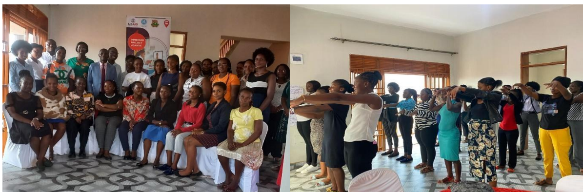
Picture 5; Left – right; a group photo of the 26 SRH champions after the first day of training; Champions conduct an SRH dance