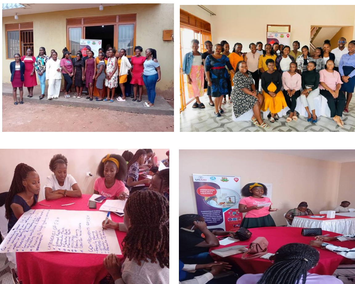
Picture 8: Group photos, group work activity and presentations during the champion's performance review meetings.

As HSV, we took on these recommendations and further discussed them internally and with the Software developer and some have been addressed while others are still work in progress. Participants were provided with meals and transport refund during these meetings. The meeting images are shown in picture 8 below;