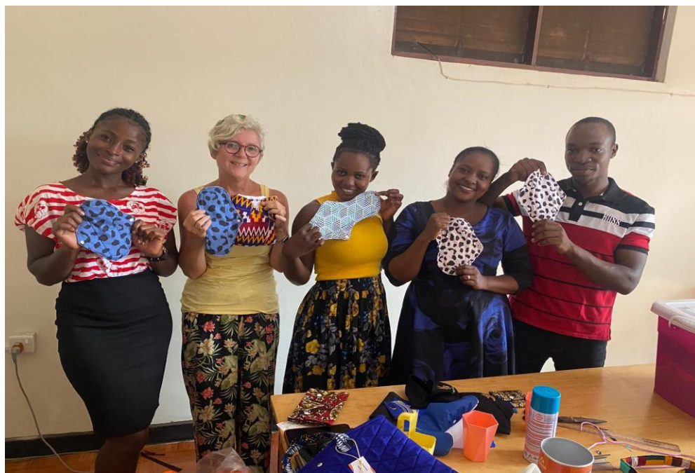
Picture 2: HSV team with the Amara pads team after an inception meeting

two large private not for profit SRH service providers including Marie stopes Uganda and Reproductive health Uganda. The project team shared partnership proposals with these providers who were positive and committed to sign the MoUs after internal discussions.