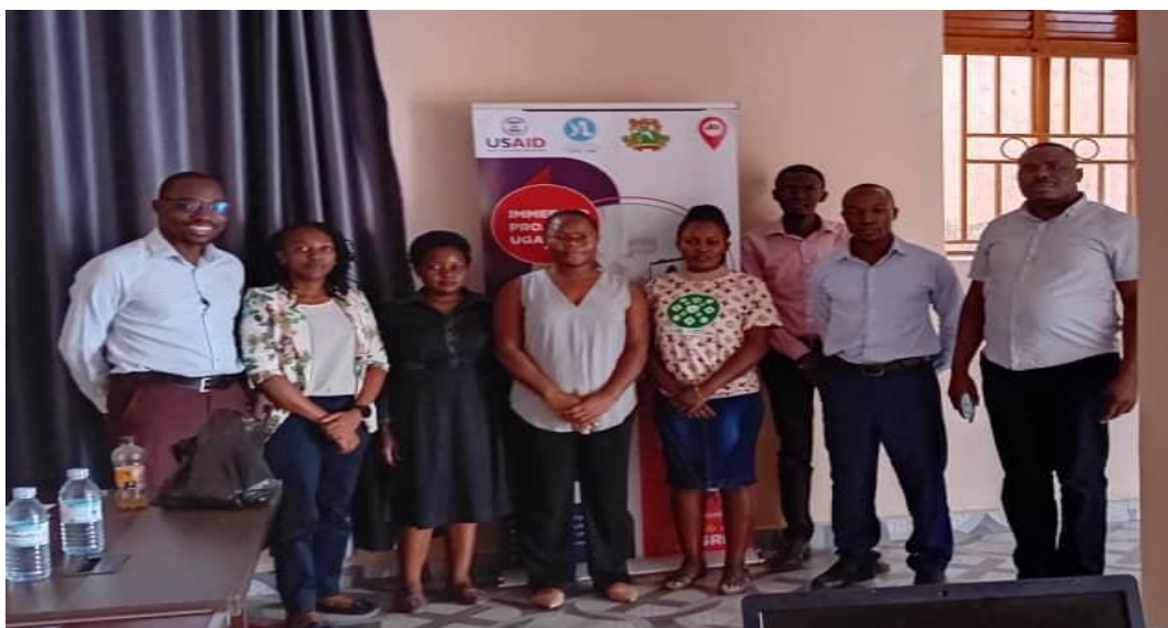
Picture 11: HSV team and the YALI grants management team shortly after the meeting.